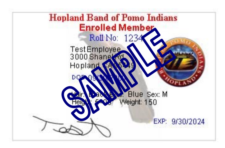
Adult Tribal Member 18+

<u>Tribal ID Cards</u> – we now have new Tribal ID cards. Stop by and have your picture taken. Only takes a few minutes to print it out for you. <u>BUT</u> if you lose your Tribal ID, it will now cost $15 per replacement.