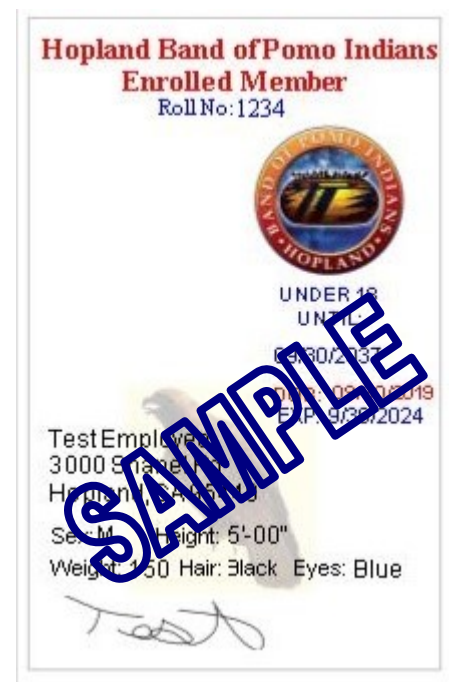
Youth Tribal Members Under 17